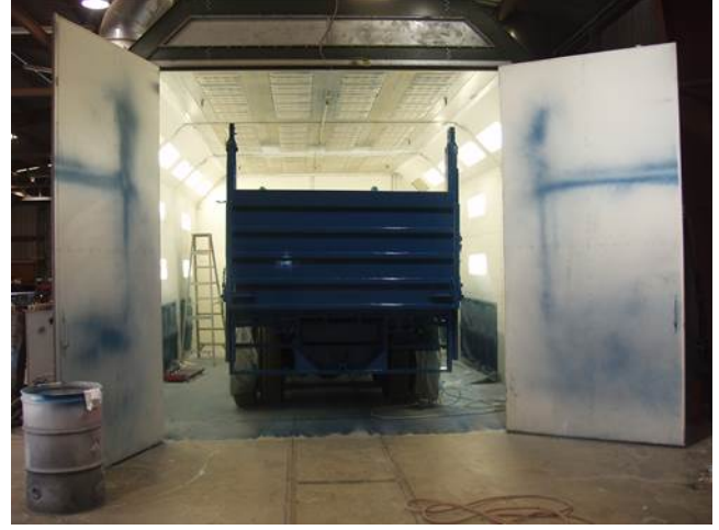
Nuisance Paint Fumes