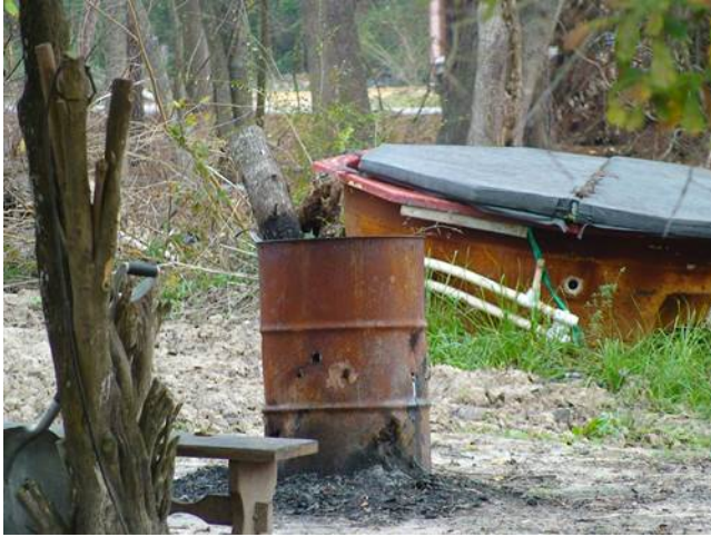
Nuisance smoke from Outdoor Burning