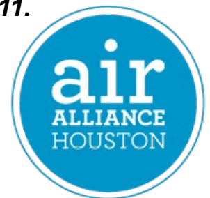
Complaints in Past 12 Months

Questions? Contact Air Alliance Houston at 713-528-3779, info@airalliancehouston.org .