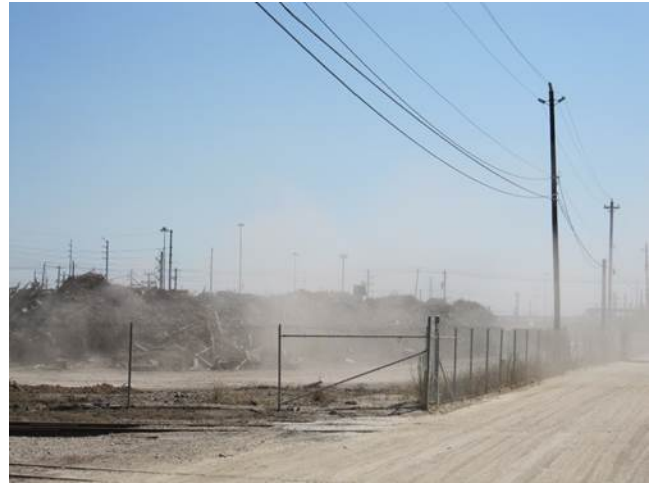
Excessive Dust Issues