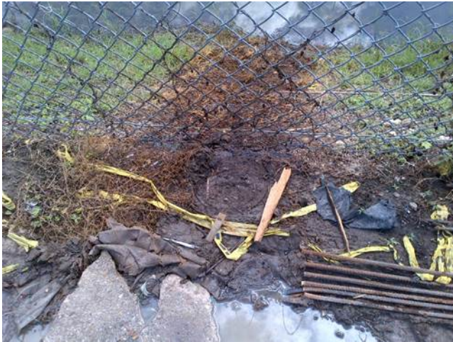
Oil Spilled on ground