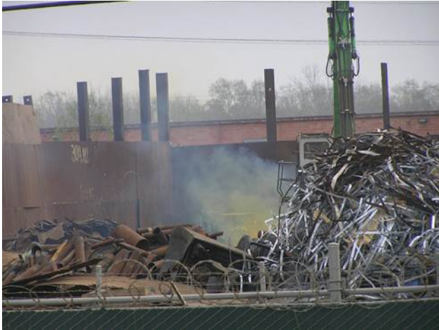
Smoke from torch cutting at Metal Recyclers