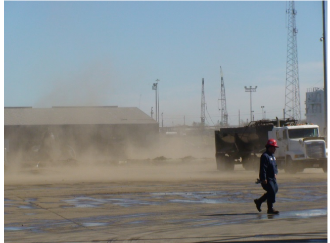
Excessive Dust Issues