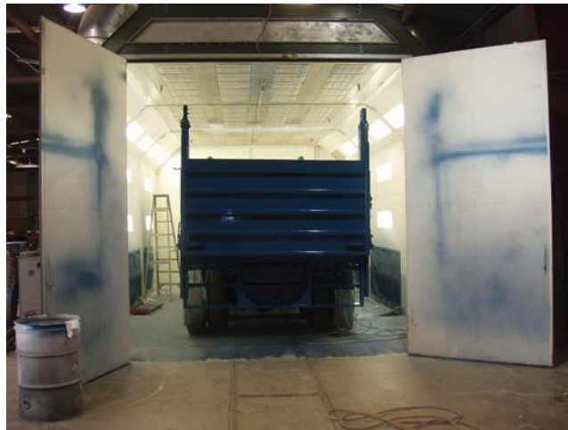
Nuisance Paint Fumes