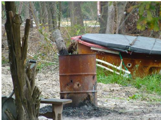
Nuisance smoke from Outdoor Burning