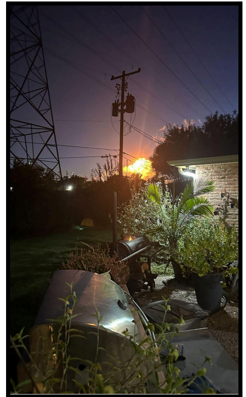
Figure 1: A past emissions event at Exxon Baytown as seen from a residential backyard.

Carbon monoxide constituted nearly half of the 92,400 pounds of air pollution released from ExxonMobil’s flares. In a well-maintained flare system, the vented gases would be burned completely and broken down into carbon dioxide and water vapor. However, the overwhelming quantity of carbon monoxide released by the facility indicates a severely inefficient flaring system. Carbon monoxide is highly poisonous, even at low concentrations, and fatally interferes with respiratory processes.