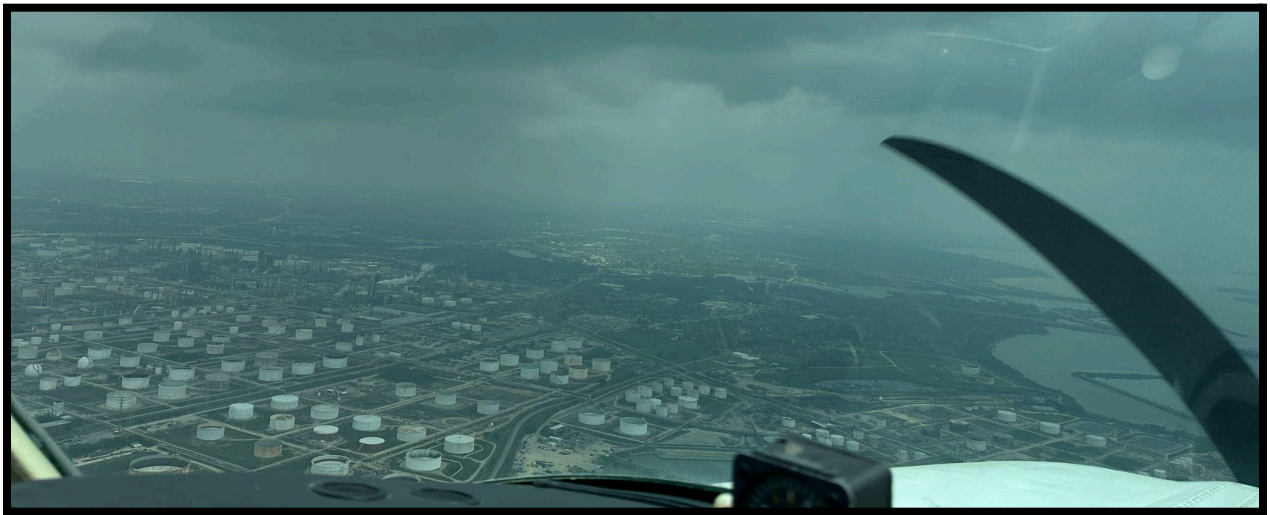
Figure 3: The Exxon Baytown Olefins Plant as photographed from an aerial flyover by Southwings

The health impacts of industrial flare pollution are not felt equally. Black, Brown, and low-income residents in Houston experience the worst pollution due to a history of redlining and systemic racism. Numerous studies show that flaring-related health conditions disproportionately impact low-income people of color and women in Houston.